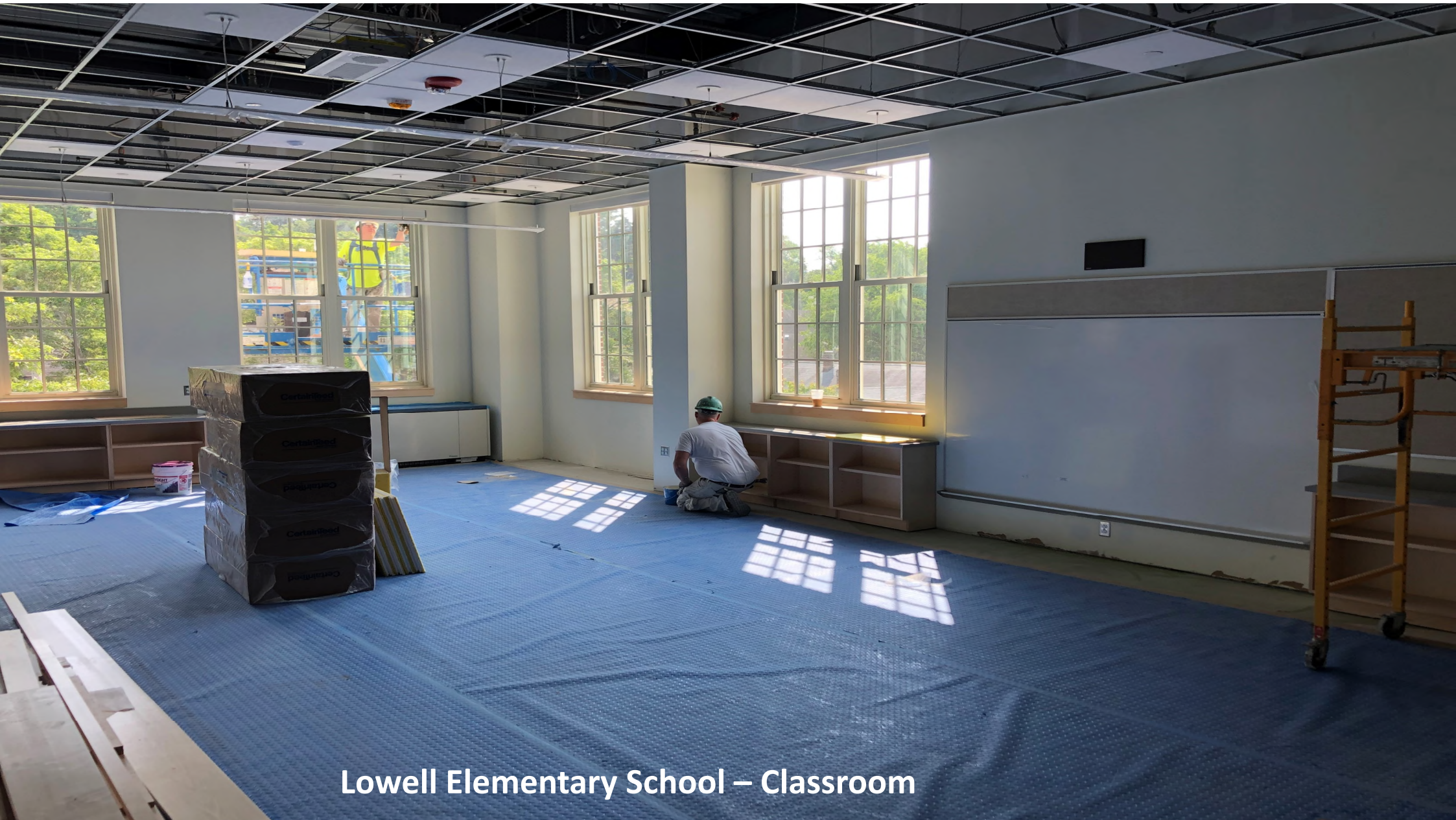
Lowell Elementary School – Classroom