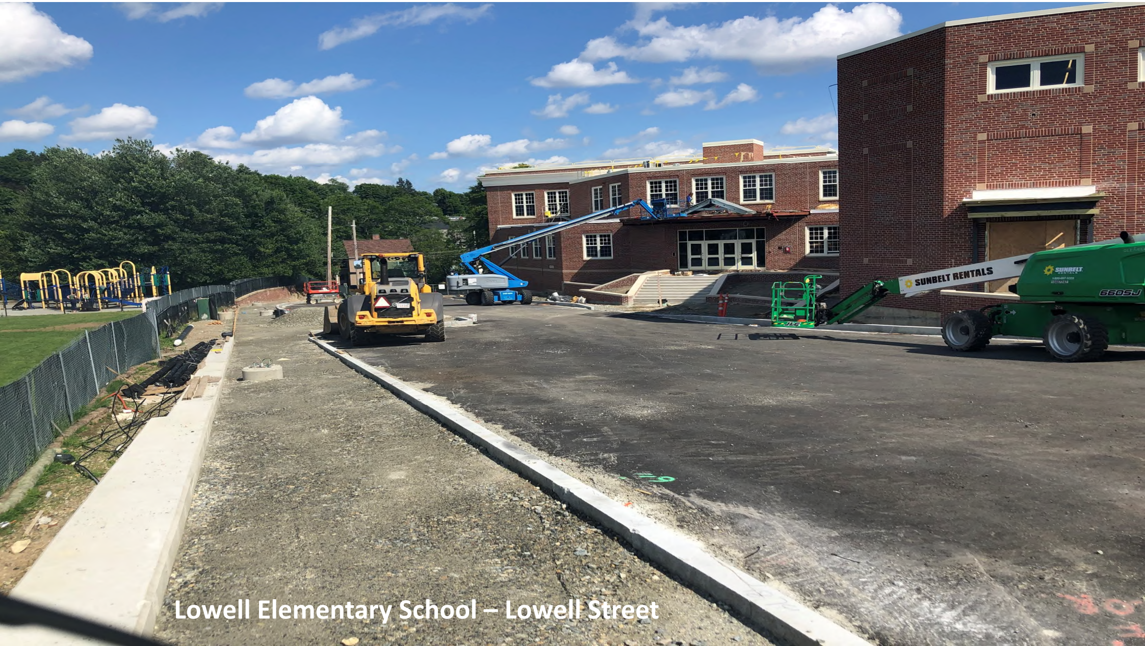
Lowell Elementary School – Lowell Street