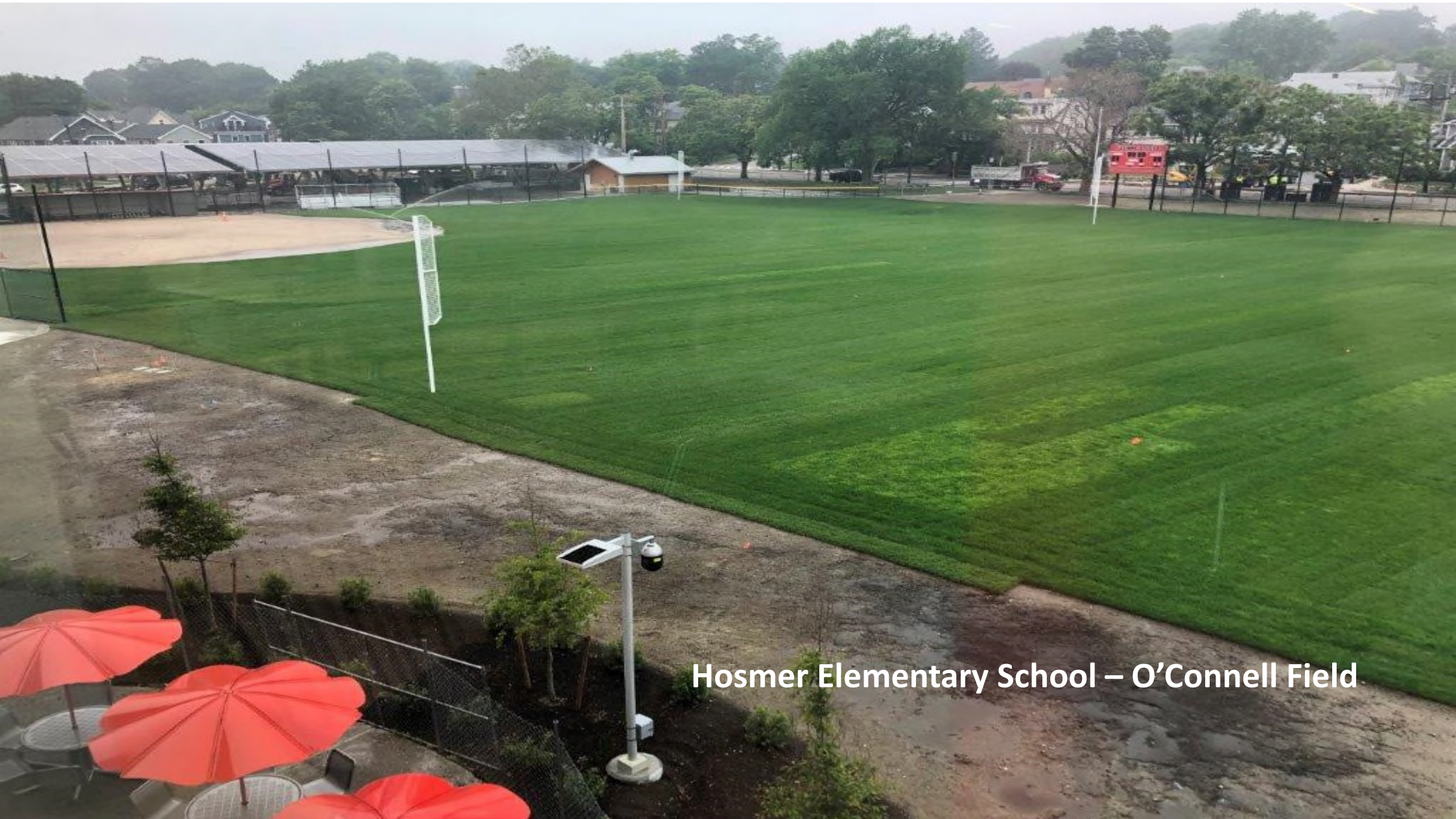
Hosmer Elementary School – O'Connell Field