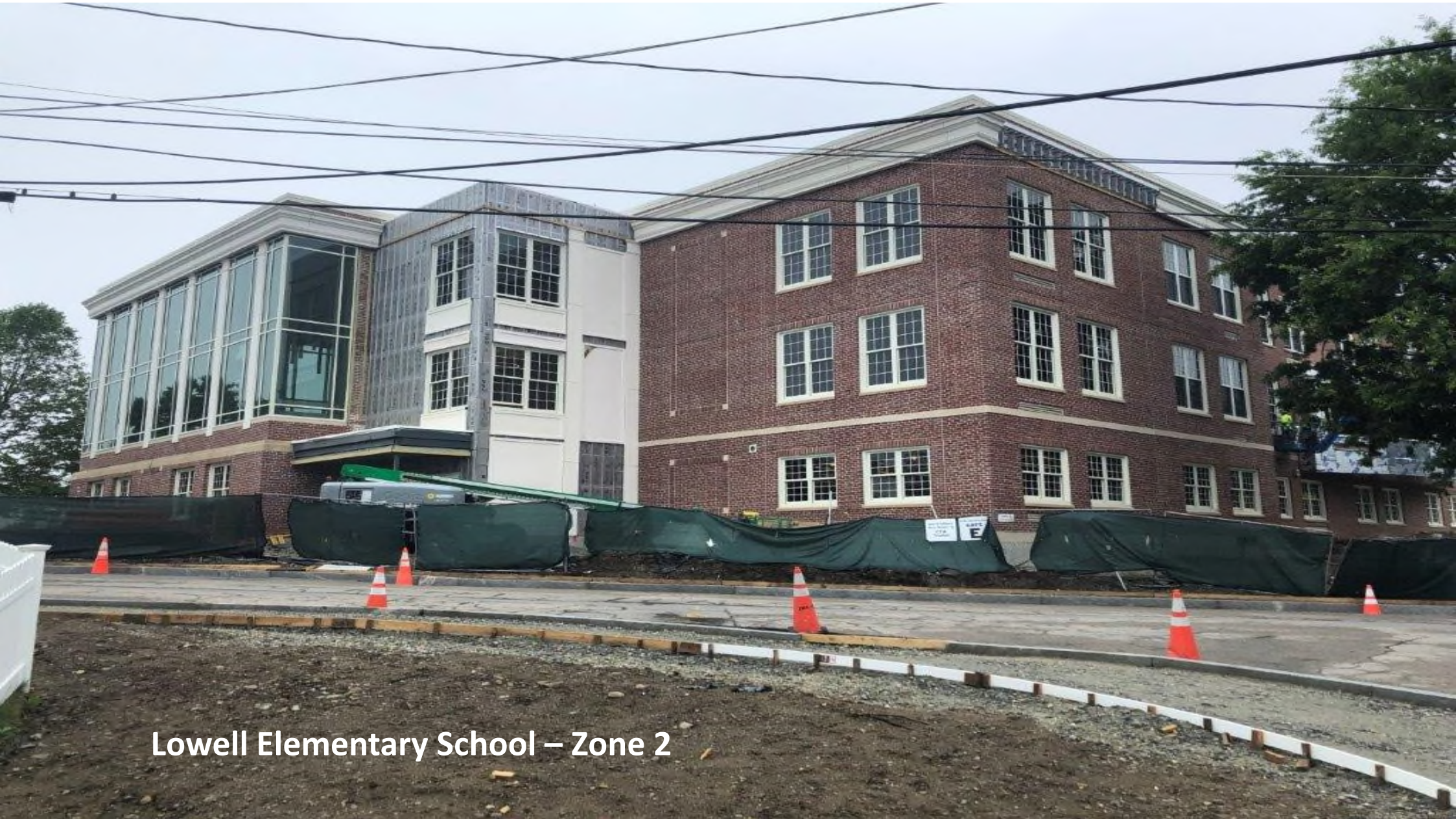
Lowell Elementary School – Zone 2