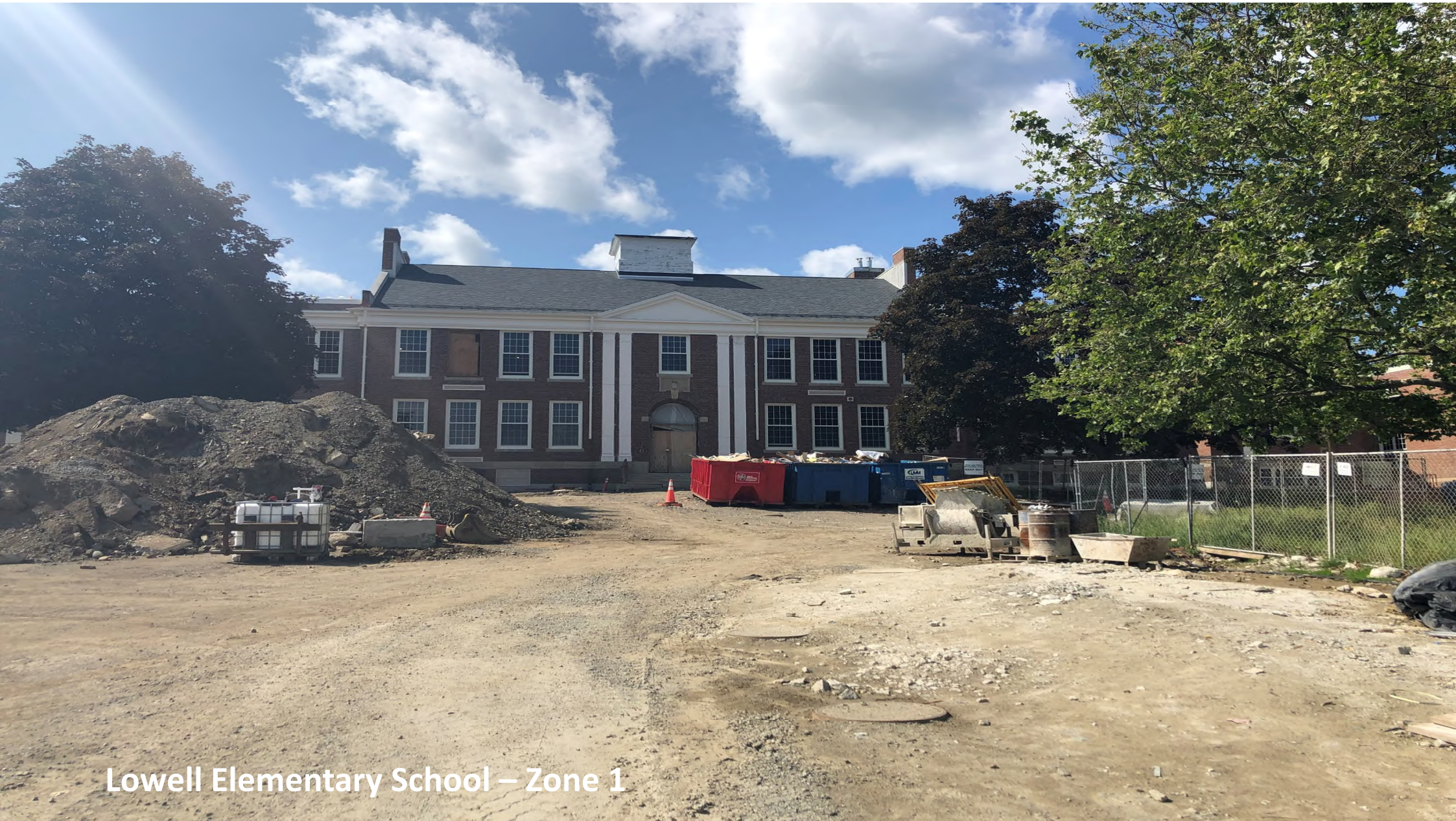
Lowell Elementary School – Zone 1