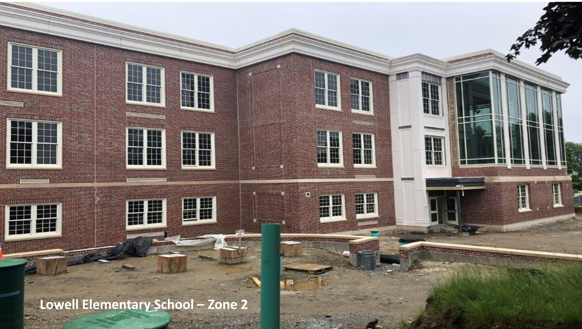
Lowell Elementary School – Zone 2