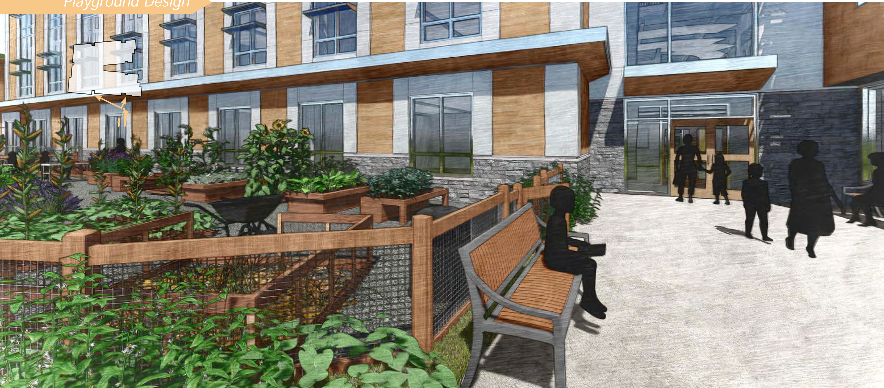
10 View of school gardens looking towards Concord Rd. entrance