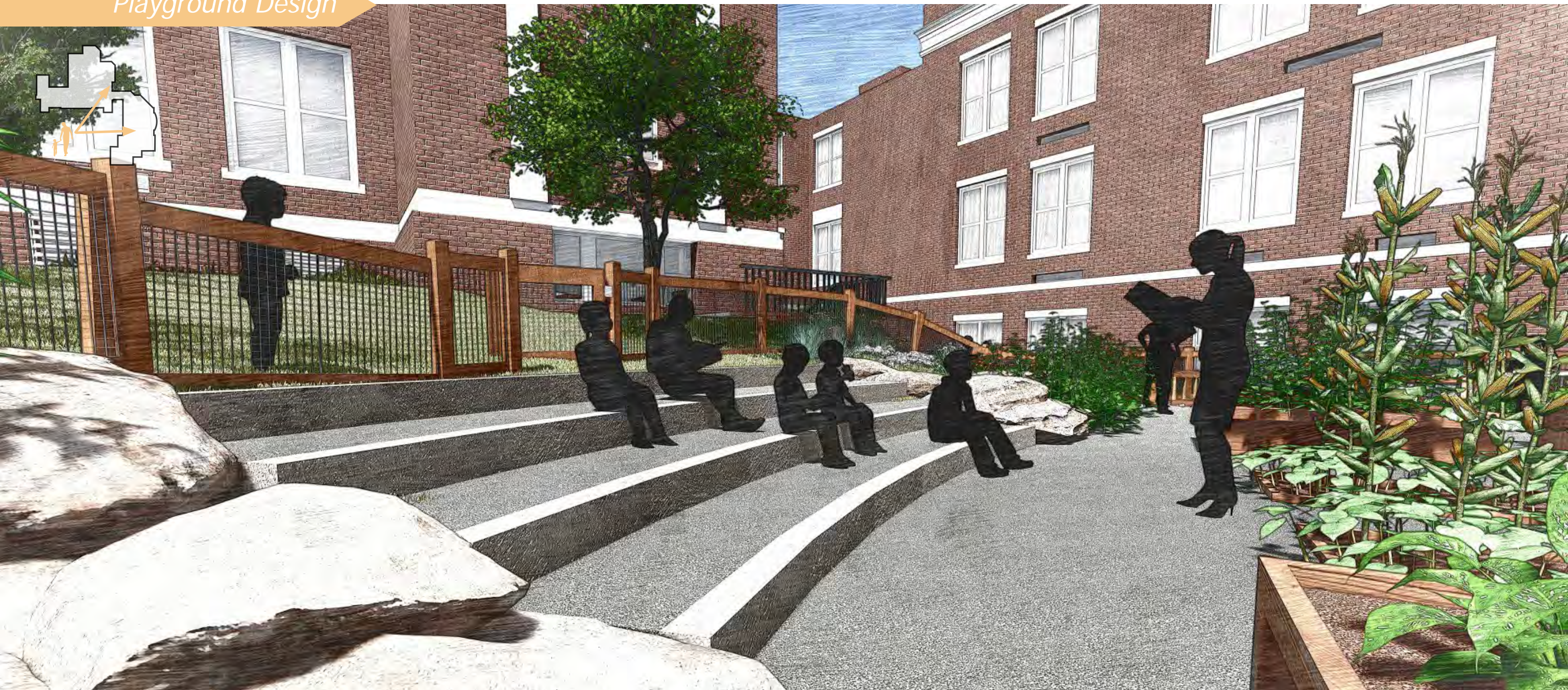
10 Learning Gardens Informal gathering