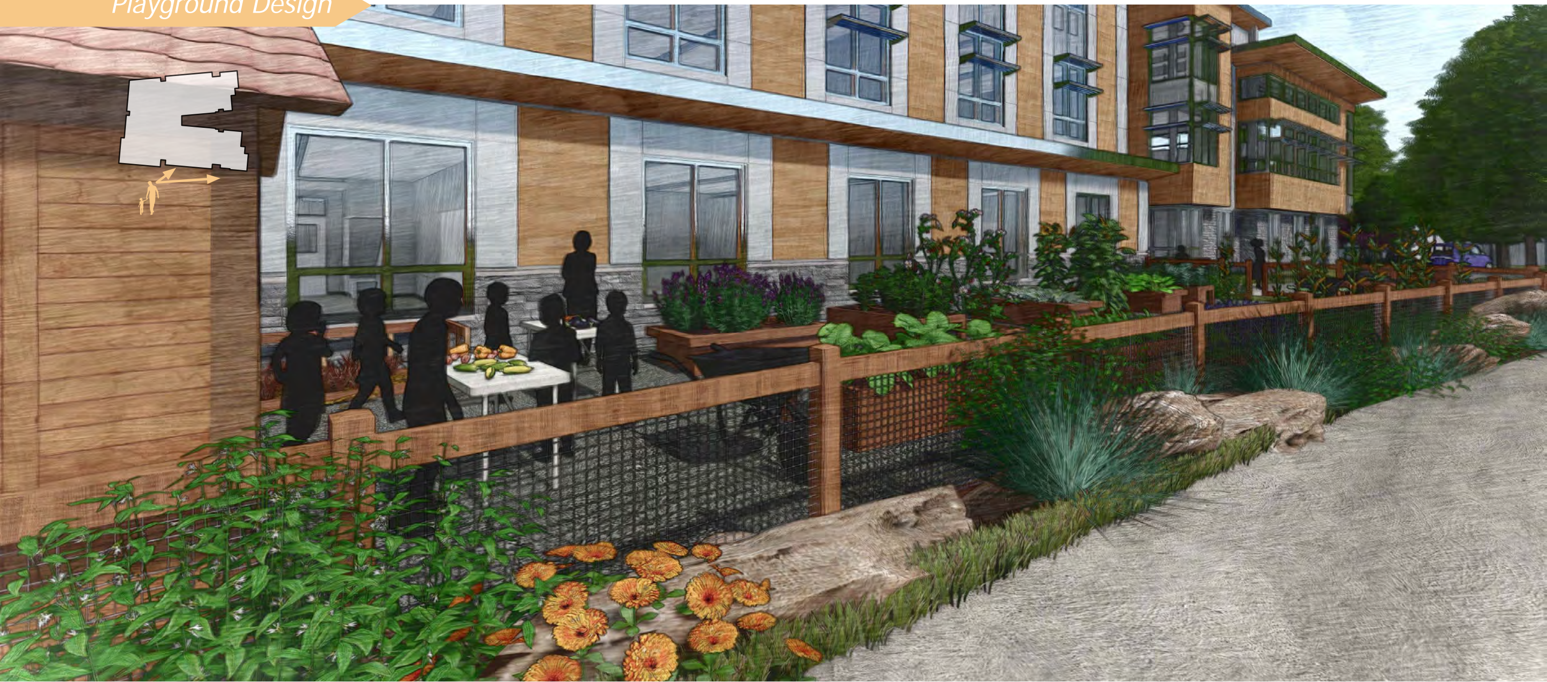
11 View of school gardens looking towards Concord Rd. entrance