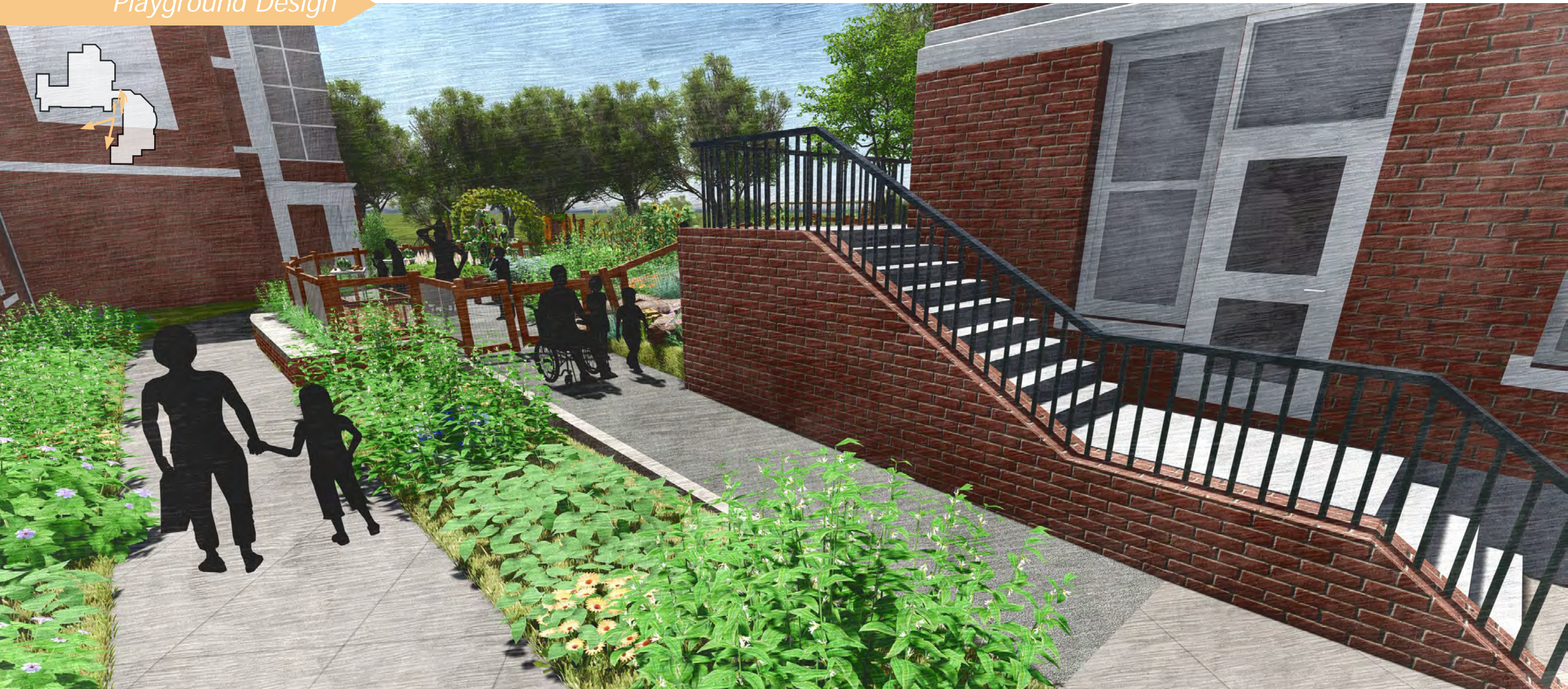
13 Accessible pathway to the garden area