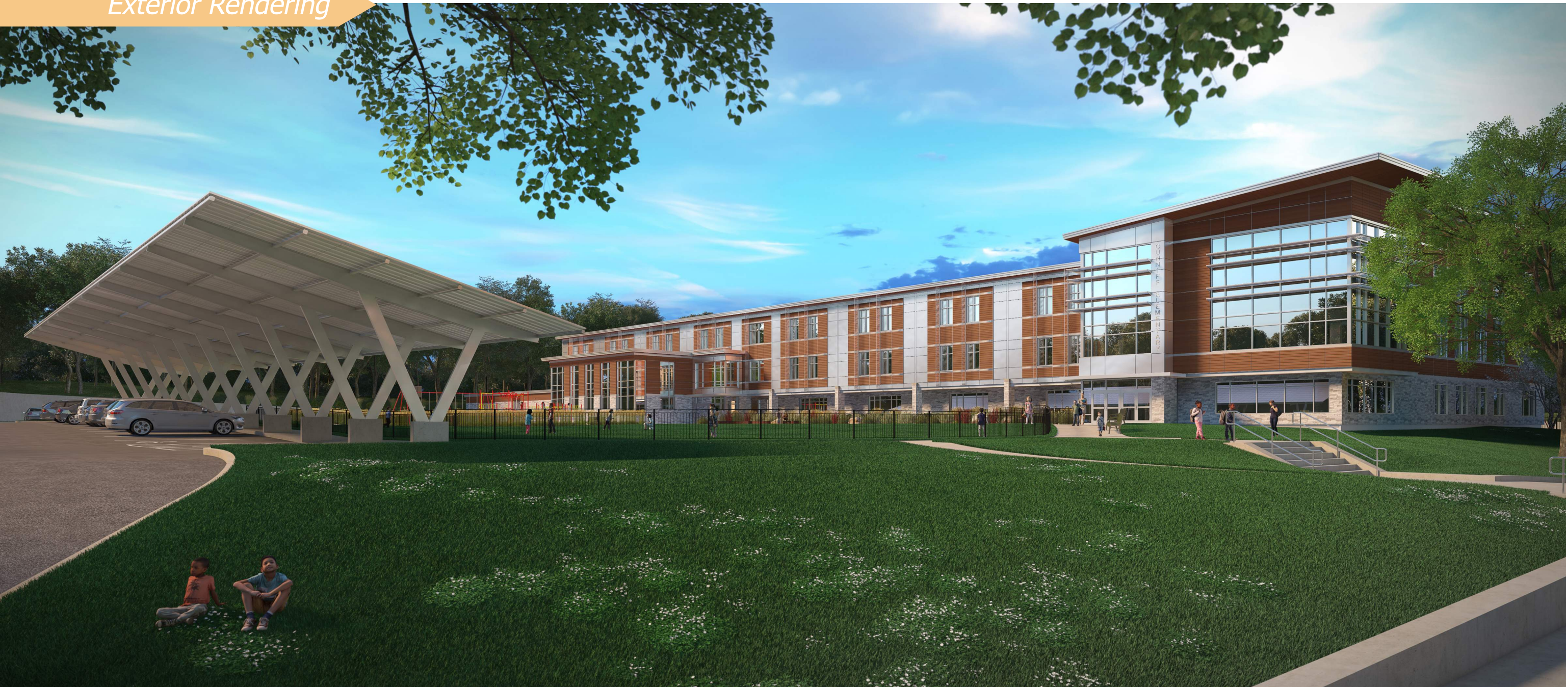
View from Warren Street