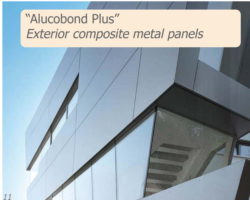
"Alucobond Plus" Exterior composite metal panels